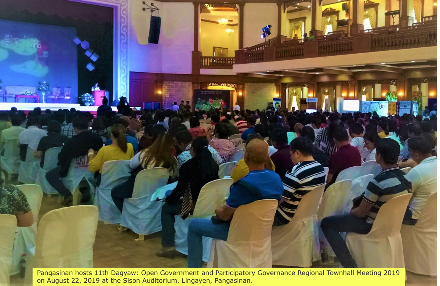
Pangasinan hosts 11th Dagyaw: Open Government and Participatory Governance Regional Townhall Meeting 2019 on August 22, 2019 at the Sison Auditorium, Lingayen, Pangasinan.

In its earnest effort to promote participatory governance, the Department of the Interior and Local Government (DILG), Department of Budget and Management (DBM), with full support from the Presidential Communications Operations Office (PCOO), conducted the 11th Dagyaw: Open Government and Participatory Governance Regional Townhall Meeting 2019 on August 22, 2019 at the Sison Auditorium, Lingayen, Province of Pangasinan.